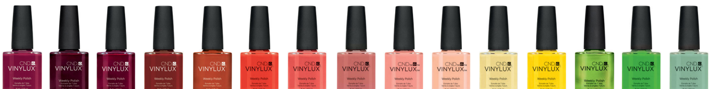
● Tinted Love #153 ▲ ● Masquerade #130 ▲ ● Crimson Sash #174 ▲ ● Burnt Romance #161 ▲ ● Fine Vermilion #172 ▲ ● Electric Orange #112 ▲ ● Desert Poppy #163 ▲ ● Clay Canyon #164 ▲ ● Salmon Run* #181 ▲ ● Dandelion* #180 ▲ ● Sun Bleached #165 ▲ ● Bicycle Yellow #104 ▲ ● Limeade #127 ▲ ● Lush Tropics #170 ▲ ● Mint Convertible #166 ▲