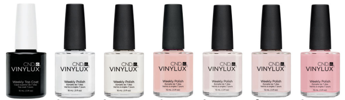
Weekly Top Coat