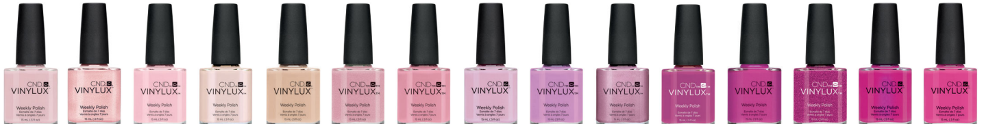
● Beau #103 ▲ ● Grapefruit Sparkle #118 ● Winter Glow* #203 ▲ ● Naked Naiveté* #195 ▲ ● Powder My Nose #136 ▲ ● Fragrant Freesia* #187 ▲ ● Blush Teddy* #182 ▲ ● Cake Pop #135 ▲ ● Beckoning Begonia* #189 ▲ ● Tundra* #205 ▲ ● Crushed Rose* #188 ● Sultry Sunset #168 ▲ ● Butterfly Queen* #190 ▲ ● Tutti Frutti #155 ▲ ● Hot Pop Pink #121 ▲