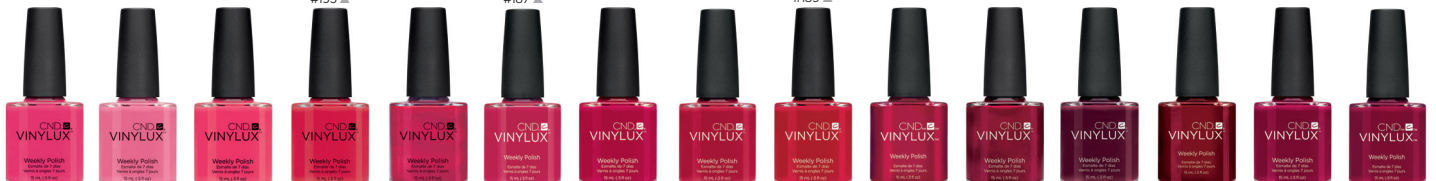
● Pink Bikini #134 ▲ ● Gotcha #116 ▲ ● Tropix #154 ▲ ● Lobster Roll #122 ▲ ● Hot Chilis #120 ▲ ● Rose Brocade #173 ▲ ● Wildfire #158 ▲ ● Rouge Red #143 ▲ ● Hollywood #119 ▲ ● Tartan Punk* #196 ▲ ● Red Baroness #139 ▲ ● Bloodline #106 ▲ ● Scarlet Letter #145 ▲ ● Decadence #111 ▲ ● Rouge Rite* #197 ▲