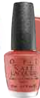
Conga-Line Coral A hip-shaking, fiery, orange-rose.