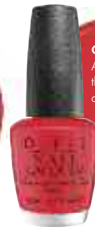
OPI on Collins Ave. A sizzling red-orange that knows where the action is.