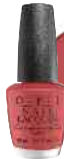
Paint My Mojitoes Red A warm rosy red for cocktails on the beach.