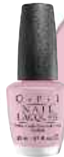
Suzi & the Lifeguard A not-so-innocent light pink.