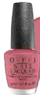
Party in My Cabana Wear your cutest bikini and this rich, "cab"-ivating pink!