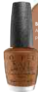
Bronzed to Perfection A toasty brown that's perfectly sexy.