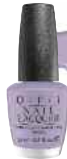
Done Out in Deco A "deco"-dent shade of arty lilac

Shades that capture the colour, the fashion, and the trend-setting excitement of the world's most stylish celeb playground!