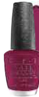
Miami Beet This racy red-violet could be your vice.