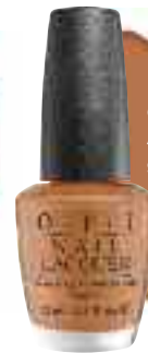
Clubbing til Sunrise A golden tangerine that goes from dusk to dawn.