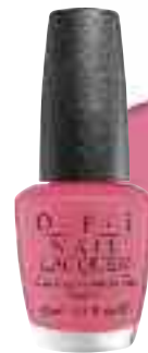
Feelin' Hot-Hot-Hot! A flamingo pink blazing with style.