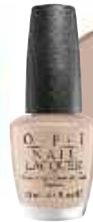
Sand in My Suit Can you "bare" this nude shade?